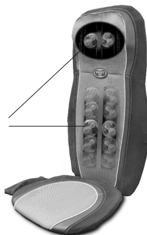
2 in 1 moving Technogel® Shiatsu massage mechanism

The actual product materials and fabrics may vary from the picture shown.