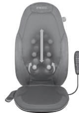
Moving Gel Shiatsu massage mechanism

For your safety, heat cannot be turned on if massage is not selected.