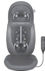
Moving Gel Shiatsu massage mechanism

HEAT - For soothing heat when massage is on, simply press the heat button and the corresponding red L.E.D. light will illuminate. To deselect, press the button again and the corresponding L.E.D. light will turn off. For your safety, heat cannot be turned on if massage is not selected.